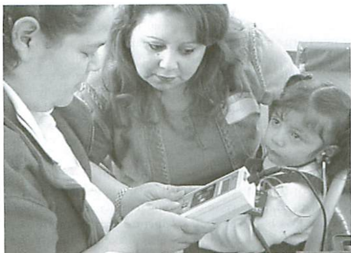
Figure 1. Photograph of child being screened using otoacoustic emissions technology.

and has been recognized by the Joint Committee on Infant Hearing. During OAE screening, the screener places a small probe, fitted with a sensitive microphone, into the child's ear canal (see Figure 1). The probe delivers a quiet sound into the ear. In a healthy ear, sound is transmitted through the middle ear to the inner ear where the outer hair cells of the cochlea respond by producing an emission sometimes described as an "echo." This emission travels back out through the middle ear and is then picked up by the microphone, analyzed by the screening unit, and a "pass" or "refer" result is displayed on the equipment screen. Every normal, healthy inner ear produces an emission that can be recorded in this way (Gorga et al., 1997).