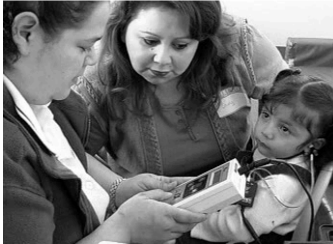
Figure 1. Photo of child being screened using OAE technology.