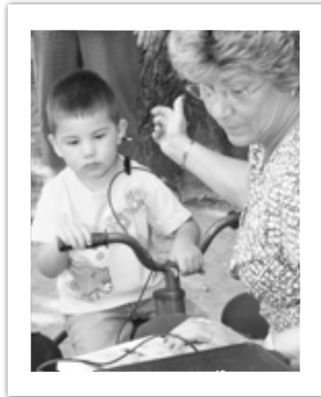
Figure 3 Trainee Learning to Screen in a Natural Setting

It is highly desirable to have an experienced pediatric audiologist serve as a mentor and trainer. It is also very helpful to teach screeners to work in teams, with one person playfully keeping the child’s attention while the other places the probe in the child’s ear and conducts the screening. Each screener should have the opportunity to screen a number of children in this supportive, supervised training setting.