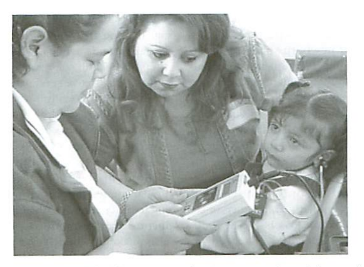
Figure 1. Photograph of child being screened using otoacoustic emissions technology.

and has been recognized by the Joint Committee on Infant Hearing. During OAE screening, the screener places a small probe, fitted with a sensitive microphone, into the child's ear canal (see Figure 1). The probe delivers a quiet sound into the ear. In a healthy ear, sound is transmitted through the middle ear to the inner ear where the outer hair cells of the cochlea respond by producing an emission sometimes described as an "echo." This emission travels back out through the middle ear and is then picked up by the microphone, analyzed by the screening unit, and a "pass" or "refer" result is displayed on the equipment screen. Every normal, healthy inner ear produces an emission that can be recorded in this way (Gorga et al., 1997).